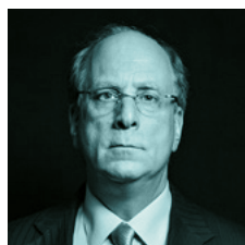
Laurence Fink Chairman and CEO, BlackRock, Inc.