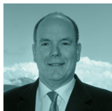
HSH Prince Albert II of Monaco Prince of Monaco