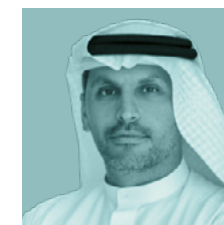
HE Khaldoon Al Mubarak Managing Director & Group CEO, Mubadala Investment Company