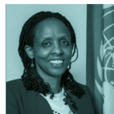
Dr Agnes Kalibata Special Envoy of the UN Secretary-General for the 2021 Food Systems Summit