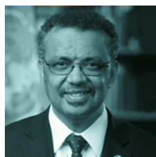
Dr Tedros Adhanom Ghebreyesus Director-General World Health Organization