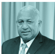
HE Frank Bainimarama Prime Minister, The Republic of Fiji