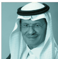
HRH Prince Abdulaziz bin Salman bin Abdulaziz al-Saud Minister of Energy, Kingdom of Saudi Arabia