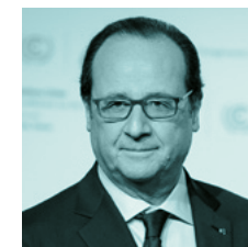
HE Francois Hollande Former President, the French Republic