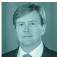
HRH King Willem-Alexander Kingdom of the Netherlands