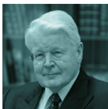
HE Ólafur Ragnar Grímsson Former President, Iceland