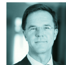
HE Mark Rutte Kingdom of the Netherlands