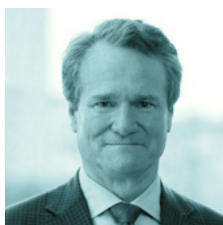
Brian Moynihan Chairman of the Board and CEO, Bank of America