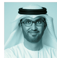
HE Dr Sultan Al Jaber Minister of Industry and Advanced Technology, UAE Special Envoy for Climate Change, Chairman of Masdar