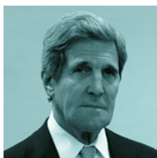
John Kerry Special Presidential Envoy for Climate, United States