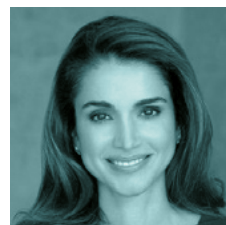
HM Queen Rania Al Abdullah Hashemite Kingdom of Jordan