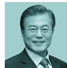
HE Moon Jae-in Former President, Republic of Korea