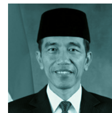
HE Joko Widodo President, Republic of Indonesia