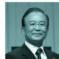
HE Wen Jiabao Former Premier of the State Council of the People's Republic of China