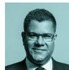
Hon Alok Sharma MP, President, COP26