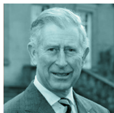
HM King Charles III United Kingdom