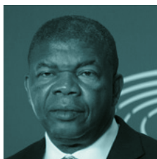
HE João Lourenço President, Republic of Angola