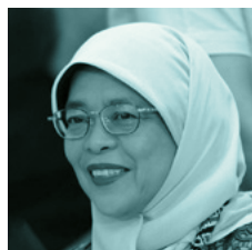
HE Halimah Yacob President, Republic of Singapore