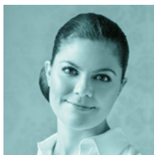
HRH Crown Princess Victoria Princess of Sweden, Duchess of Västergötland