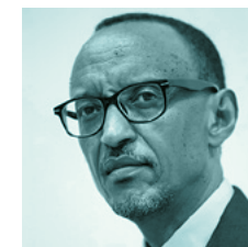
HE Paul Kagame President, Republic of Rwanda