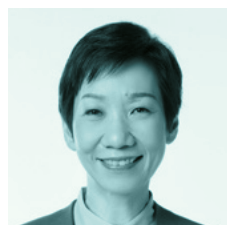
HE Grace Fu Minister for Sustainability and the Environment, Republic of Singapore