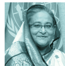
HE Sheikh Hasina Prime Minister, Republic of Bangladesh