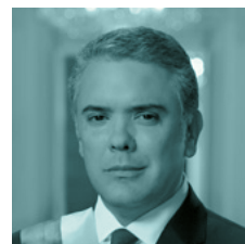
HE Iván Duque Márquez President, Republic of Colombia