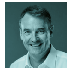
Bernard Looney Chief Executive Officer, bp