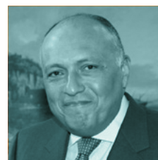
HE Sameh Shoukry Minister of Foreign Affairs, President-Designate COP27, Egypt