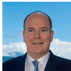
HSH Prince Albert II of Monaco Head of State, Principality of Monaco