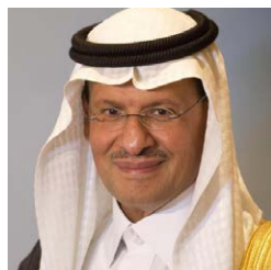
HRH Prince Abdulaziz bin Salman bin Abdulaziz al-Saud Minister of Energy for the Kingdom of Saudi Arabia