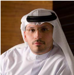
HE Khaldoon Al Mubarak Managing Director & Group Chief Executive Officer, Mubadala Investment Company