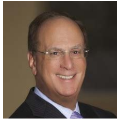
Laurence Fink Chairman and Chief Executive Officer, BlackRock, Inc.