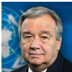
António Guterres Secretary-General of the United Nations