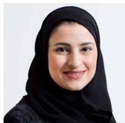
HE Sarah Al Amiri Minister of State for Advanced Sciences, UAE