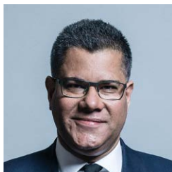
Rt Hon Alok Sharma MP COP26 President