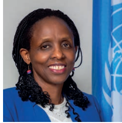
Dr. Agnes Kalibata Special Envoy of the UN Secretary-General for the 2021 Food Systems Summit