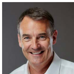
Bernard Looney Chief Executive Officer, BP