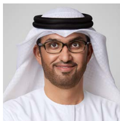
HE Dr. Sultan Al Jaber Minister of Industry and Advanced Technology, UAE special envoy on climate change, Chairman of Masdar