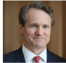
Brian Moynihan Chairman of the Board and CEO, Bank of America