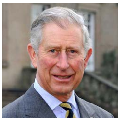
HRH Charles Prince of Wales