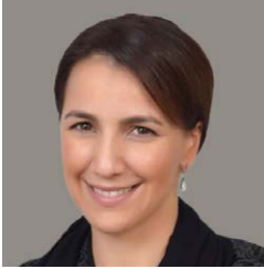
HE Mariam Al Mheiri Minister of Climate Change and Environment, UAE