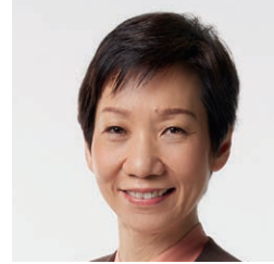
HE Grace Fu Minister for Sustainability and the Environment of the Republic of Singapore