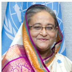
HE Sheikh Hasina Prime Minister of the Republic of Bangladesh