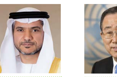
HE Ban Ki-moon Former Secretary-General, United Nations