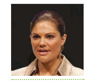
HRH Crown Princess Victoria of Sweden